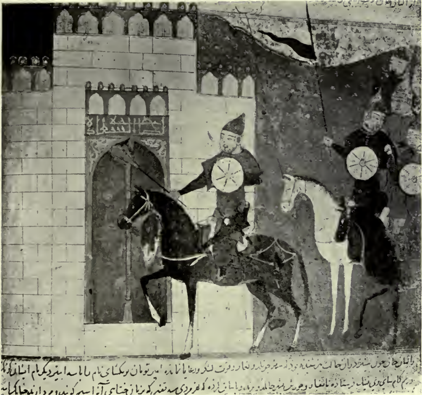
Mongol siege of a Chinese town, from an old ms..of the Jāmi'ū't-Tawārikh in the Bibliothèque Nationale