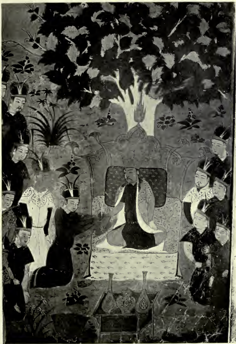
Enthronement of Ogotáy, the son and successor of Chingíz, from an old ms. of the Jámí'ut-Tawárikh in the Bibliothèque Nationale.