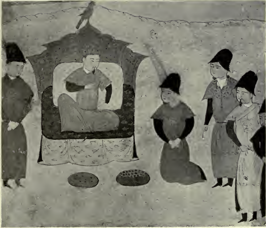
Bátú, the grandson of Chingíz, holds his Court on the Volga

From an old ms. of the Jámi'ut-Tawárikh in the Bibliothèque Nationale